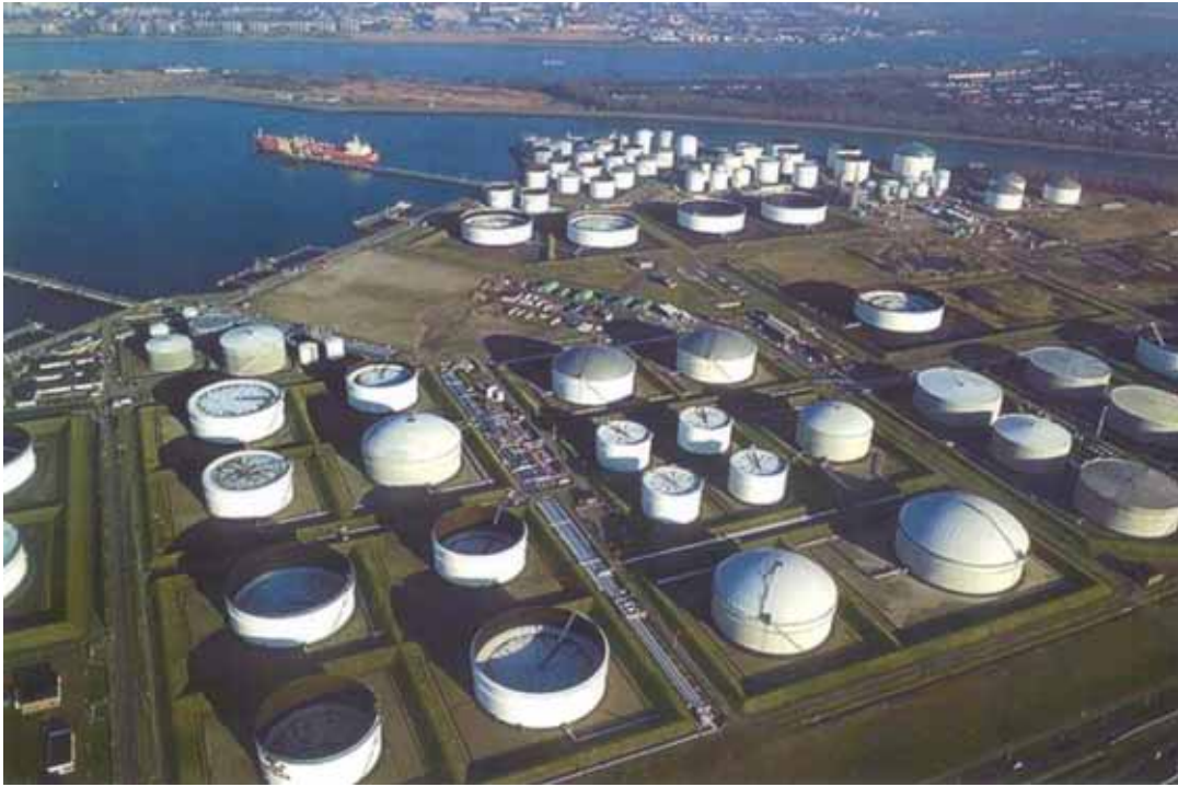
DOMES SUPPLIED BY TRADICO TO KUWAIT PETROLEUM EUROPOORT